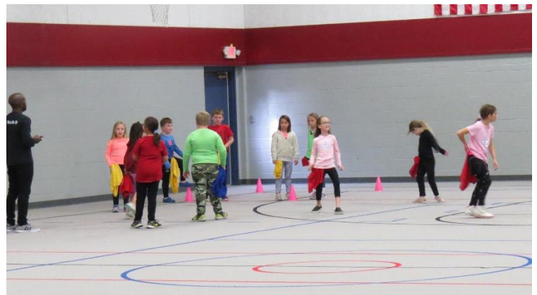
1st/2nd Grade Class