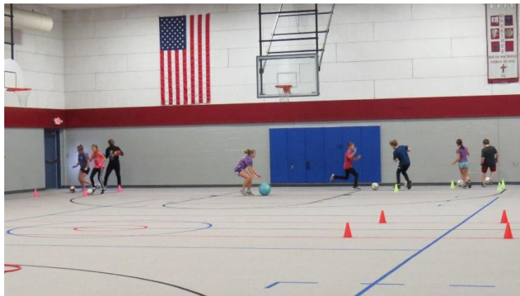
6th Grade Class