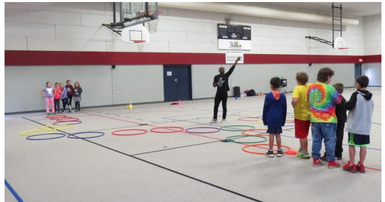
3rd Grade Class