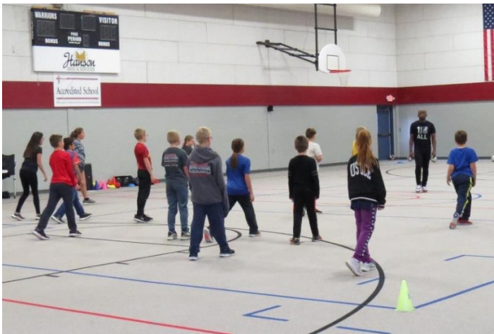
4th/5th Grade Class