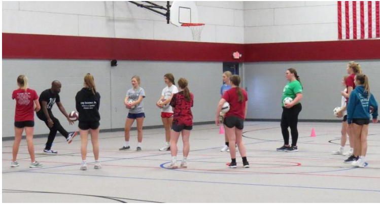
8th Grade Class