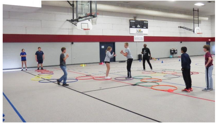
7th Grade Class