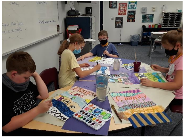
5/6 Grade Oil Pastel Watercolor Name Art

We still have blue trash bags for sale. They are $10 per roll and can be purchased in the office. We are sold out of the white and yellow trash bags.